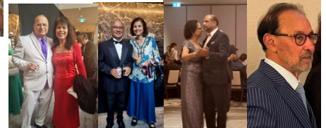
Prominent ARAIA Members

The cream of the community graced the event. The night filled with dance and fun was broadcasted live to Canada, Australia, and India. A spectacular end to a week of activities.