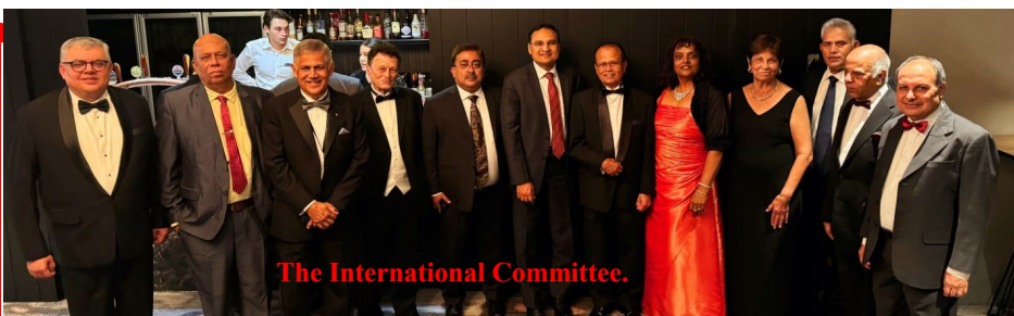
The International Committee.

This event you won't want to miss. Secure your tickets now. Please refer the next page for more details.