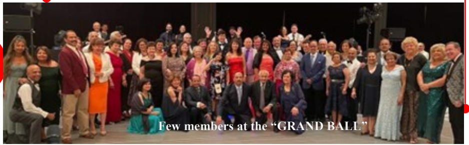
Few members at the "GRAND BALL"